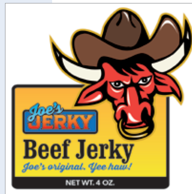
Standard 4" x 4" label